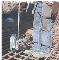
Extension bar (Option)

Both the National Institute for Occupational Safety and Health Construction Safety Association of Ontario reports state the MAX Re-bar Tying Tool reduces the risk of Carpal Tunnel Syndrome and other work related musculoskeletal disorders.