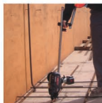
Extension bar (Option)

Using the optional extension bar reduces the risk of back injuries.