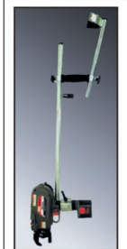
Extension bar (JE200)