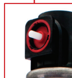
Easy attachment nozzle